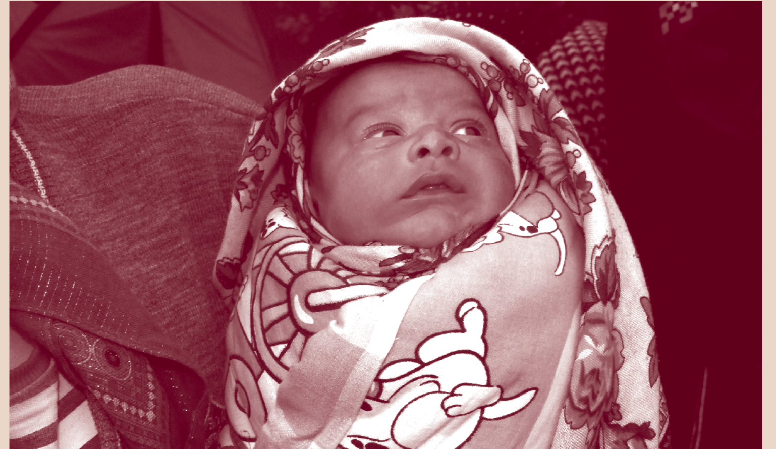
Roma Family at M50 roundabout, 2007. Pavée Point.

“WOMEN SHOULD NOT HAVE TO FACE RACISM; WOMEN SHOULDN'T BE AFRAID TO GO IN HOSPITAL.”