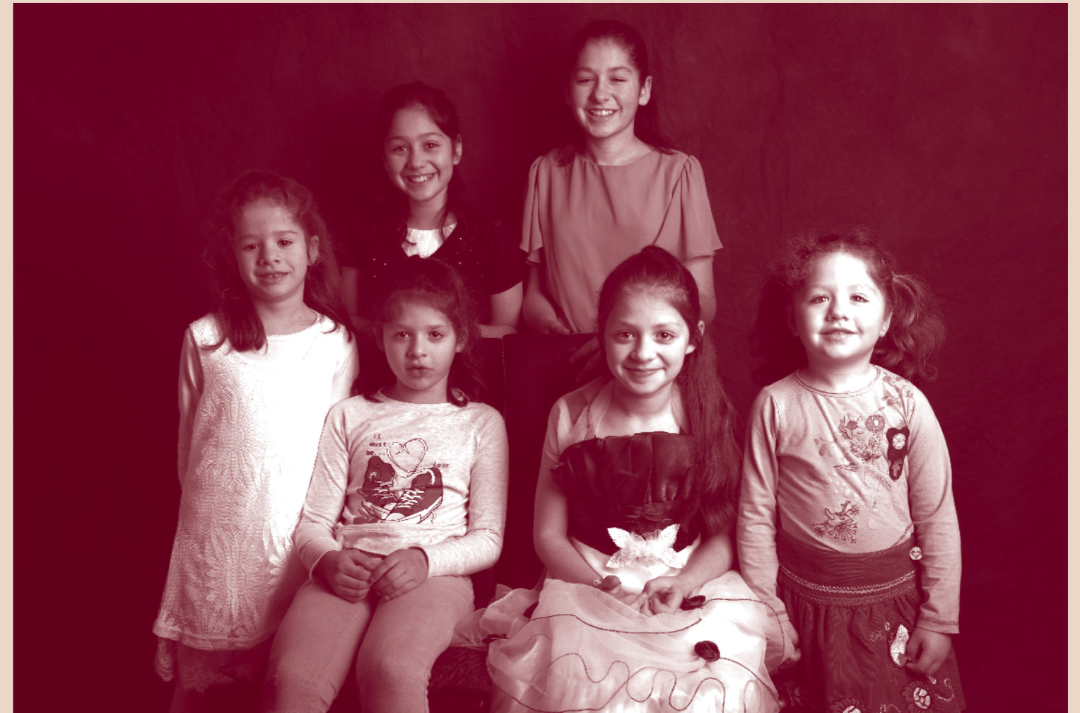
Roma children doing homework.

“IMPROVING HEALTH SYSTEMS CANNOT BE SEEN AS A TECHNOCRATIC EXERCISE; BY BRINGING HUMAN RIGHTS TO BEAR, TRANSFORMING HEALTH SYSTEMS CAN AND SHOULD BE UNDERSTOOD AS A MEANS OF CONSTRUCTING SOCIAL CITIZENSHIP FOR WOMEN IN A SOCIETY — AND MOST CRITICALLY FOR POOR, RURAL AND MARGINALIZED WOMEN.” Lynn Freedman