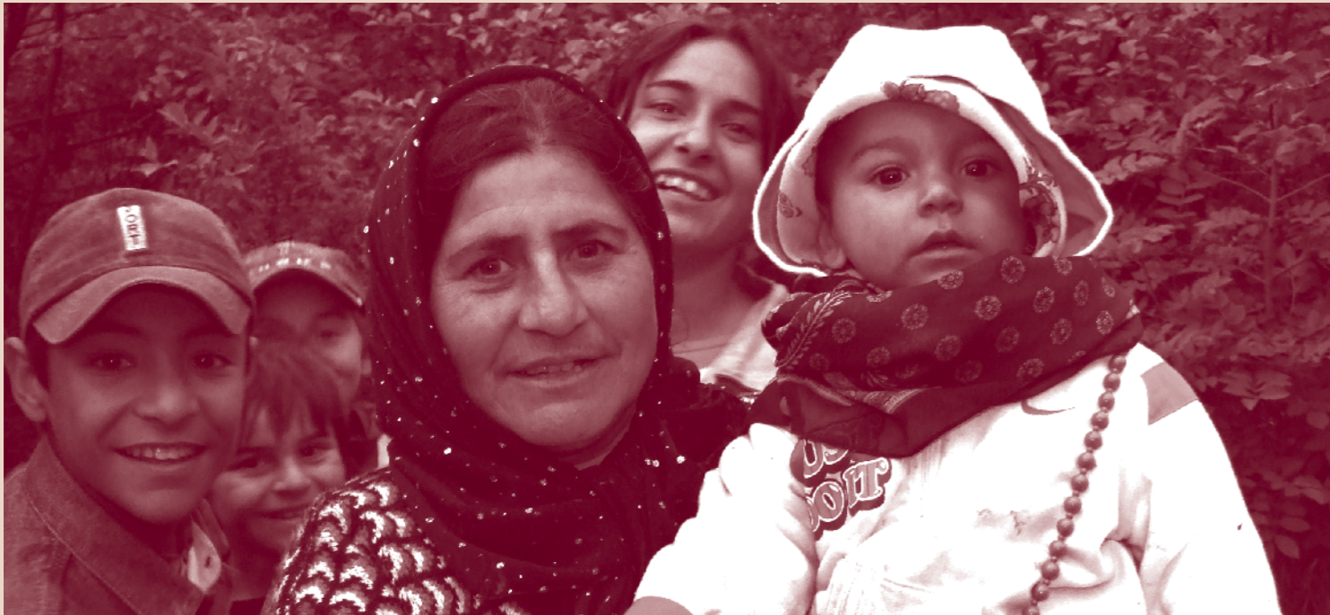
Roma Boy with Grandmother

“THE RIGHT TO HEALTH IS CLOSELY RELATED TO AND DEPENDENT UPON THE REALIZATION OF OTHER HUMAN RIGHTS, AS CONTAINED IN THE INTERNATIONAL BILL OF RIGHTS, INCLUDING THE RIGHTS TO FOOD, HOUSING, WORK, EDUCATION, HUMAN DIGNITY, LIFE, NON-DISCRIMINATION, EQUALITY, THE PROHIBITION AGAINST TORTURE, PRIVACY, ACCESS TO INFORMATION, AND THE FREEDOMS OF ASSOCIATION, ASSEMBLY AND MOVEMENT. THESE AND OTHER RIGHTS AND FREEDOMS ADDRESS INTEGRAL COMPONENTS OF THE RIGHT TO HEALTH.”