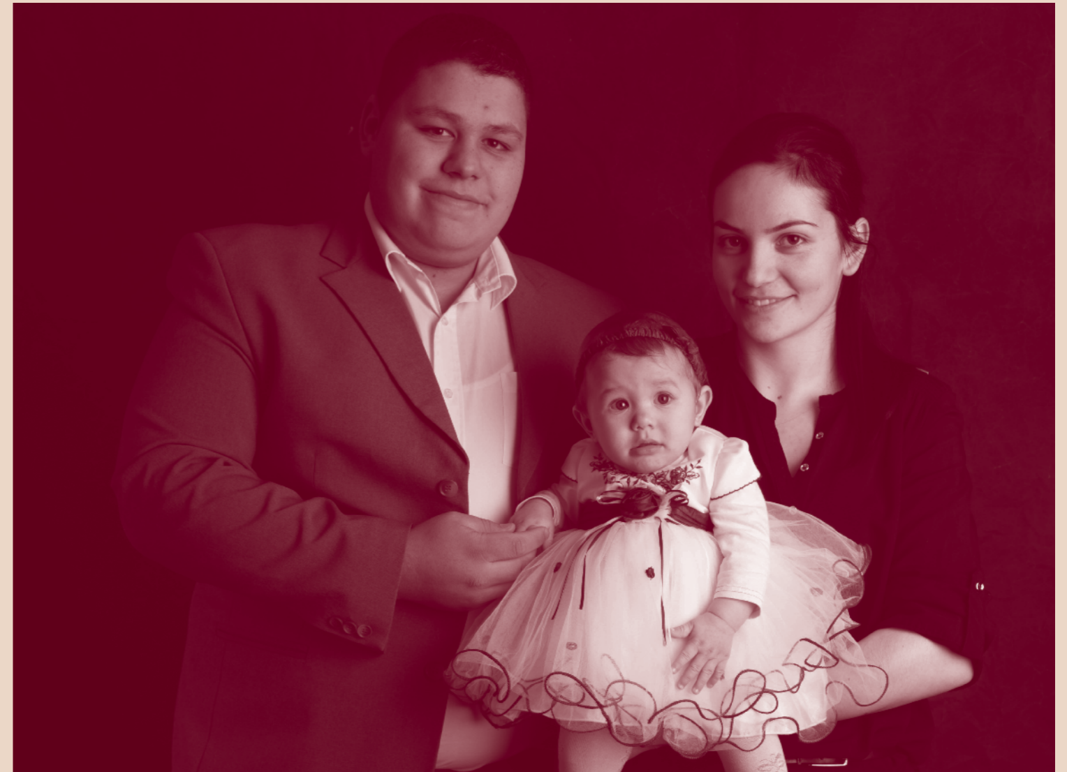
Roma Children in Ireland

“ACCOUNTABILITY IN A HUMAN RIGHTS- APPROACH TO MATERNAL HEALTH RELATES TO OBLIGATIONS TO ‘RESPECT, PROTECT AND FULFILL’ A WIDE ARRAY OF CIVIL AND POLITICAL RIGHTS, AS WELL AS ECONOMIC AND SOCIAL RIGHTS, AND GOES FAR BEYOND THE HEALTH SECTOR.” Committee on Economic, Social and Cultural Rights