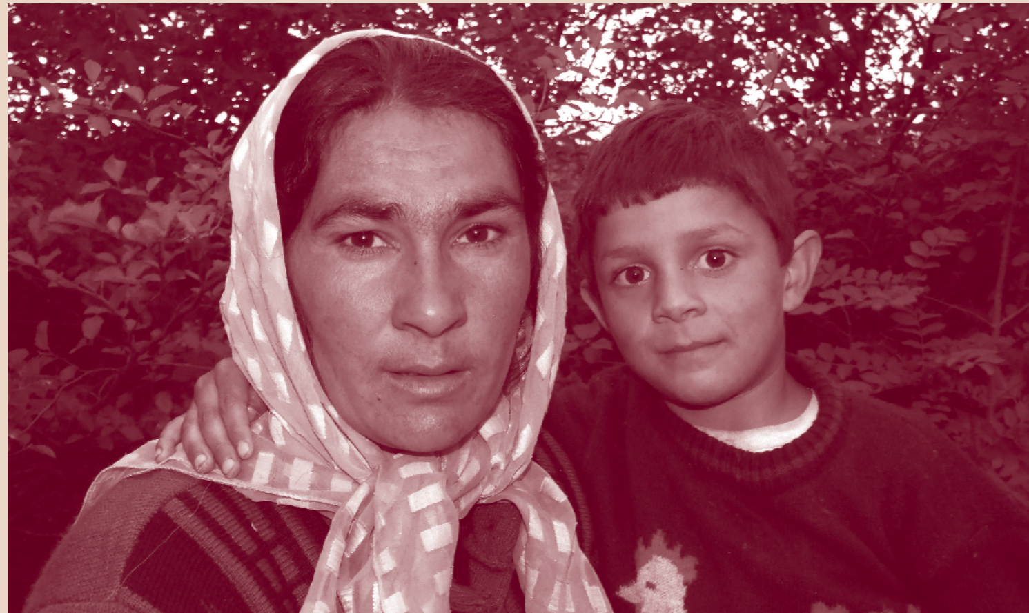
Mother with Child at M50 roundabout, 2007. Pavée Point.