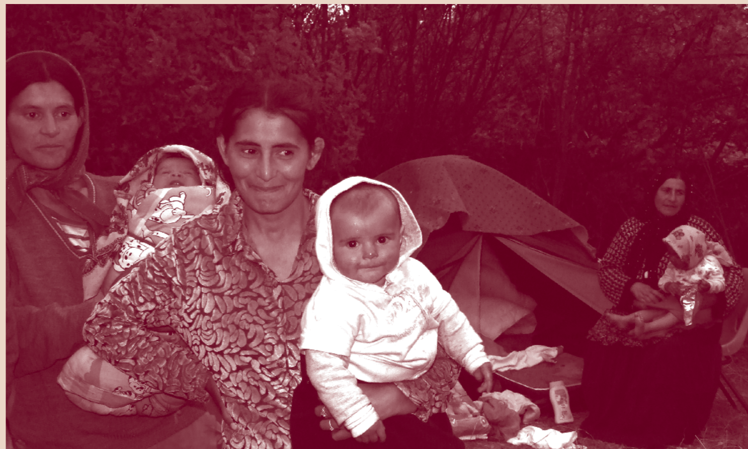
Mother with Child at MSO roundabout, 2007.

“EUROPE HAS A SHAMEFUL HISTORY OF DISCRIMINATION AND SEVERE REPRESSION OF THE ROMA. THERE ARE STILL WIDESPREAD PREJUDICES AGAINST THEM IN COUNTRY AFTER COUNTRY ON OUR CONTINENT.”